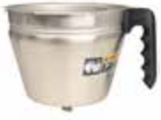
FUNNEL ASSY, W/ INSERTS SMTF